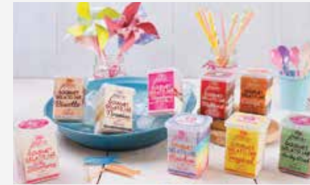
6. Gelato Jar

Combination of chocolate & two layers of vanilla butterscotch (brown sugar & butter) gelato