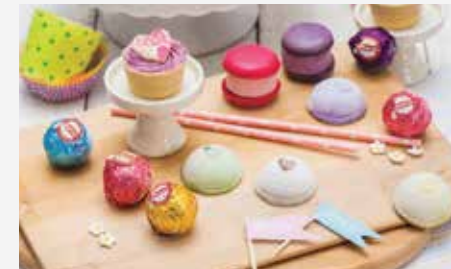
7. Petite Mix