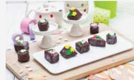
8. Gelato Candy