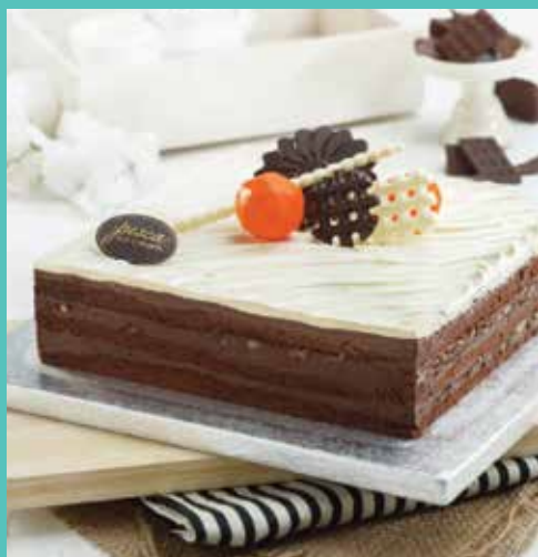
10. Choco Rich Truffle

Smooth new york cheesecake filled with chunky oreo biscuits & oreo crumble