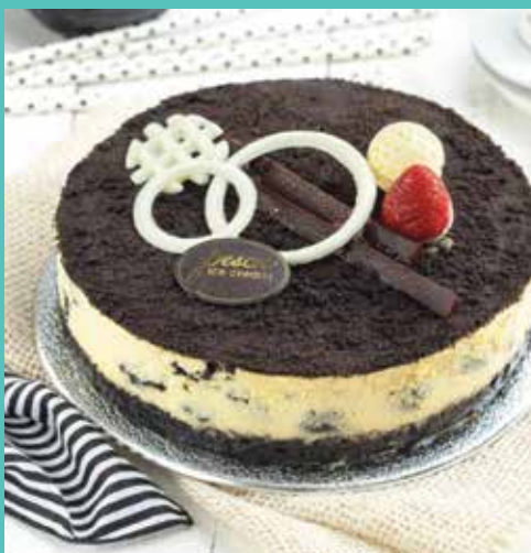
11. Oreo Cheesecake

Moist mocca sponge cake layered with crispy choco-mocca cream & chocolate ganache on top